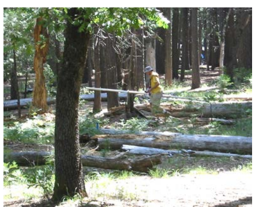
Technician acquiring ground conductivity data using a Geonics EM-31 terrain conductivity meter

Spectrum collected EM-31 and magnetics data at 2.5foot spacing along lines spaced 5 feet apart within the entire 7 acres. Detailed utility locating was conducted in order to distinguish EM-31 and magnetics anomalies caused by utilities from those caused by shallow boulders. In addition, a detailed map was made of both